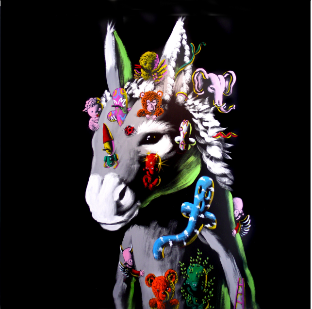
New paintings, "Moya at Gulliver" (2009)