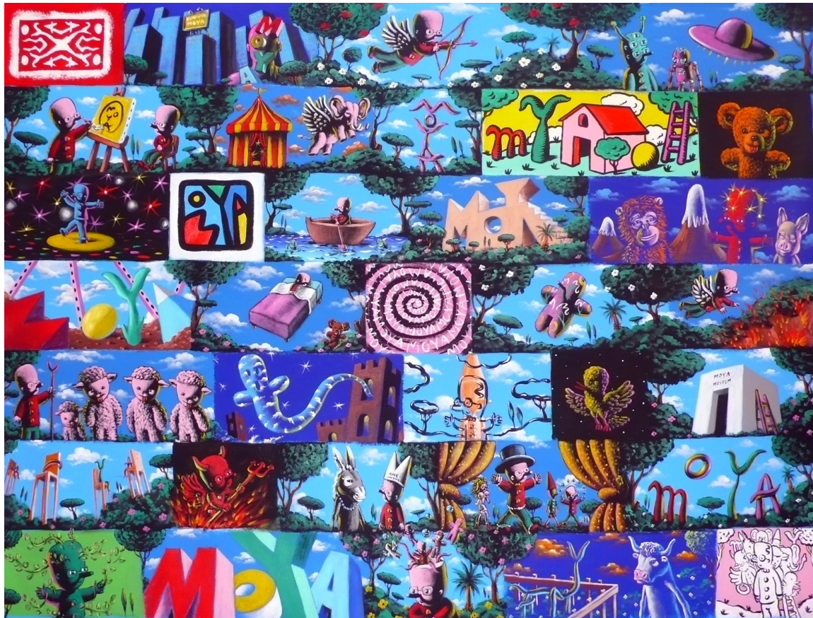
Classical Moya "mosaic" (2007)