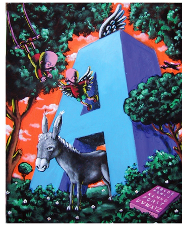
The Moya alphabet, 26 paintings (details)