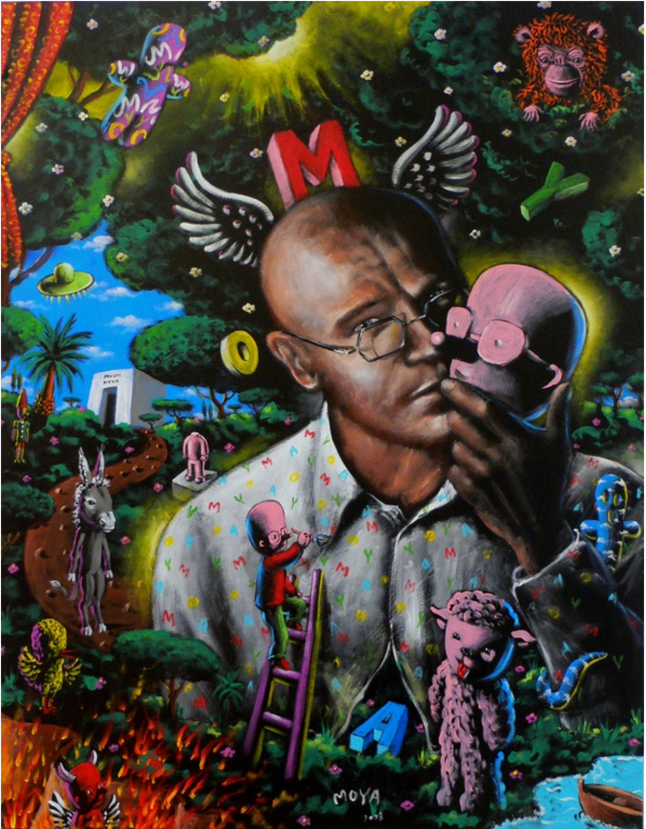
Self portrait, 2009