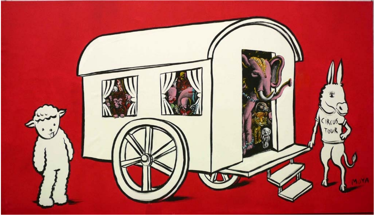
The Moya Circus (painting for the Monte-Carlo Circus world festival, 2008)