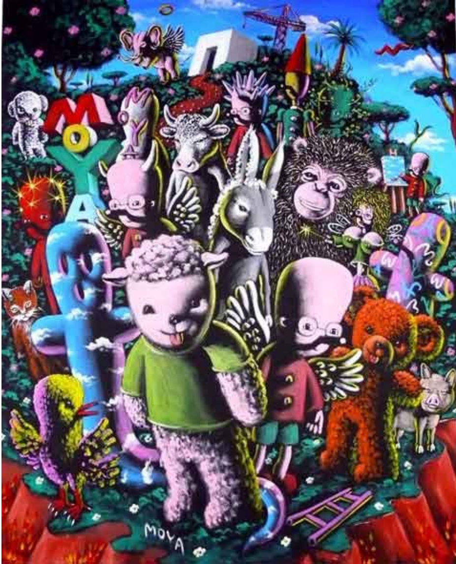
The complete Moya Universe, 2007