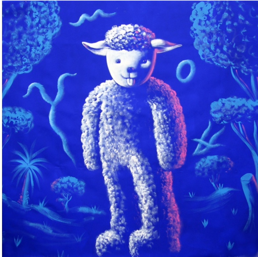
The Dolly of Moya (2005)